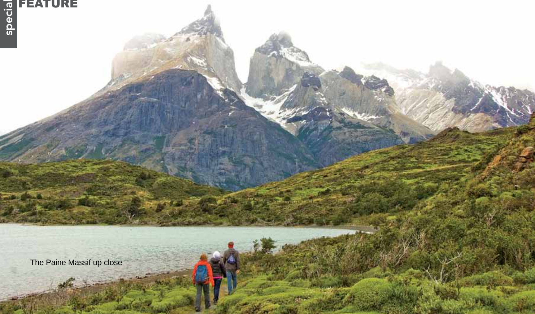
The Paine Massif up close