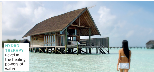
HYDRO THERAPY Revel in the healing powers of water

HOW TO GET THERE: Singapore Airlines has flights from Manila to Maldives via Singapore.